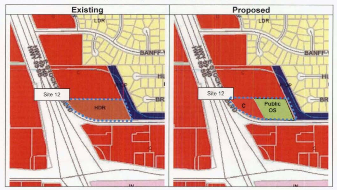
Location of, and Proposed General Plan Action for, Site 12